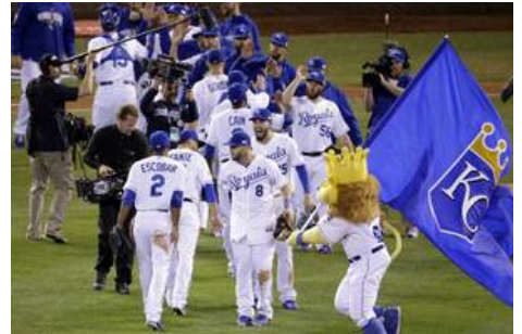
Royals send World Series back to San Francisco tied at one with 7-2 victory